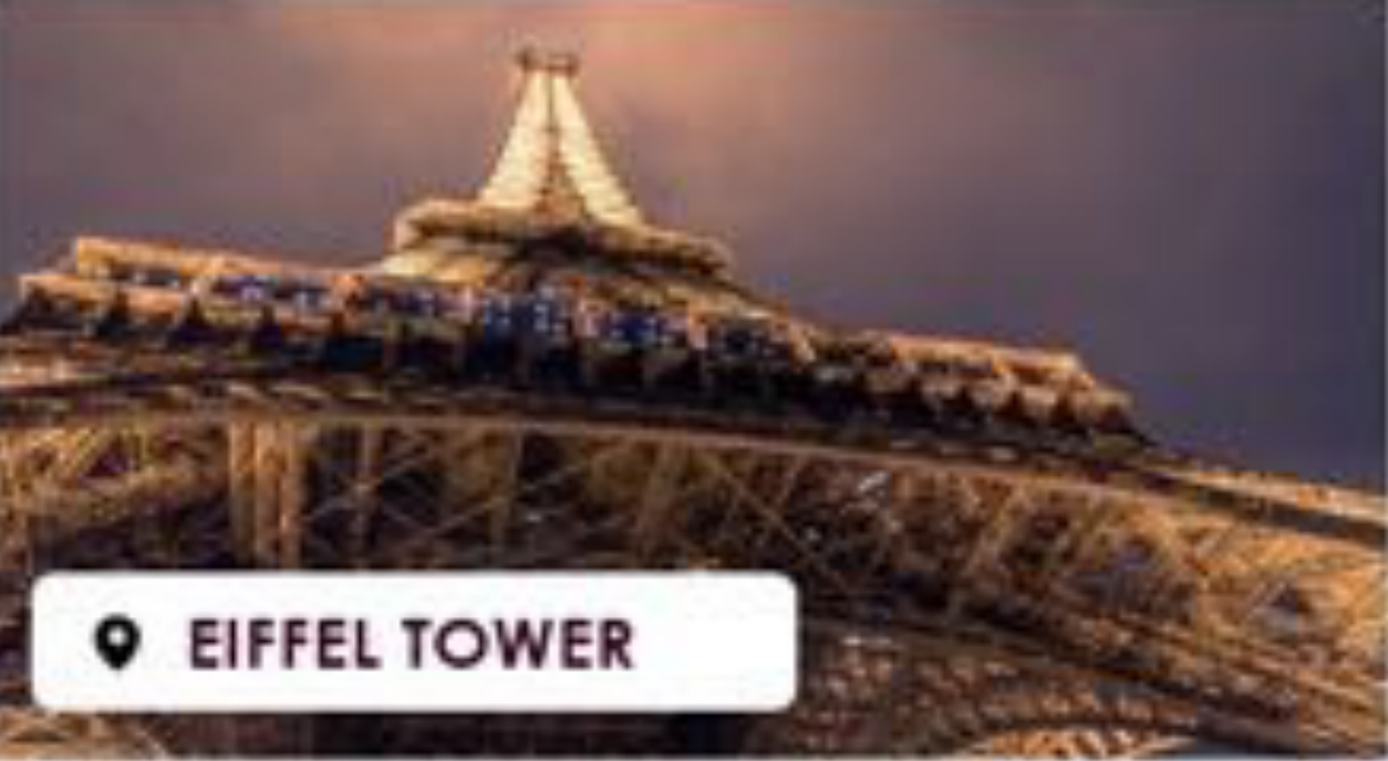
📍 EIFFEL TOWER